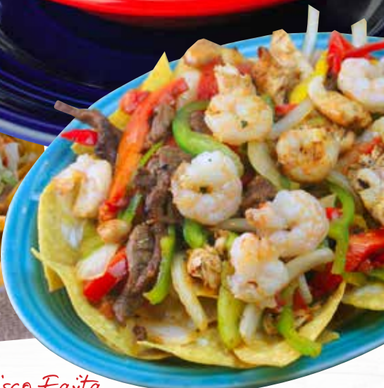
Nachos Jalisco Fajita