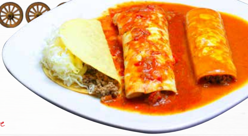
Combo Twenty Five